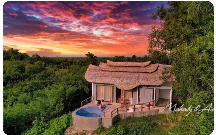
Tilagaon Eco Village, Sreemangal

For booking any resort & services please visit our website - https://www.resortsbd.com/