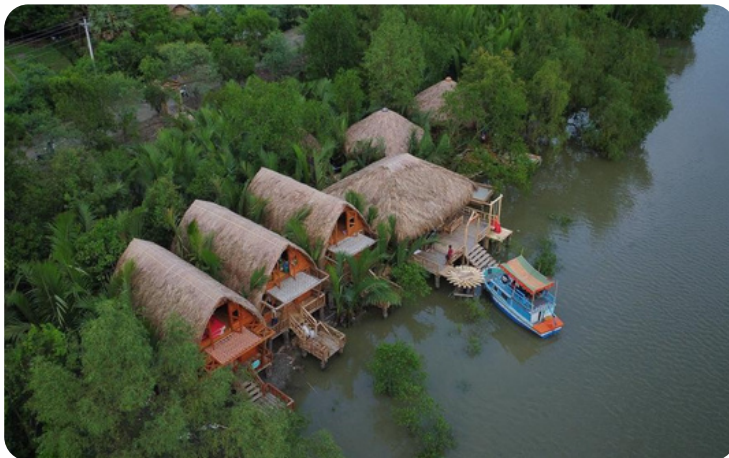
Banabash Eco Village, Sundarban