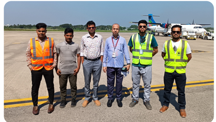
Expansion of Chattogram Shah Amanat International Airport (Design Phase) (EIA-DRONE-TOPO Survey)

Consulting O'CREEDS continues to grow ever day thanks to the confidence our clients have in us. We cover many industries such as financial, energy, business services, consumer products