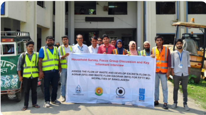
Assess the flow of waste and develop Excreta Flow Diagram (SFD) and Waste Flow Diagram (WFD) for fifty municipalities of Bangladesh