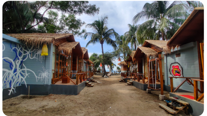
Shurjosnan Twin Beach Resort, Saint Martin