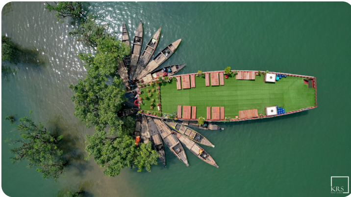
Sindabad Tori, Tangua Haor

Tour Group Bangladesh belongs to those who have an affection for traveling. We would be delighted to provide support to those who really love to roam around, no matter where the destination is! Let's discover home first & then the earth! Welcome to visit Bangladesh, a land of rivers, high lands with evergreen fields and forests, longest sea beach of the World and many more! Bangladesh is very promising tourism friendly place! It's not only for the exquisite nature but also for the amicable and hospitable.