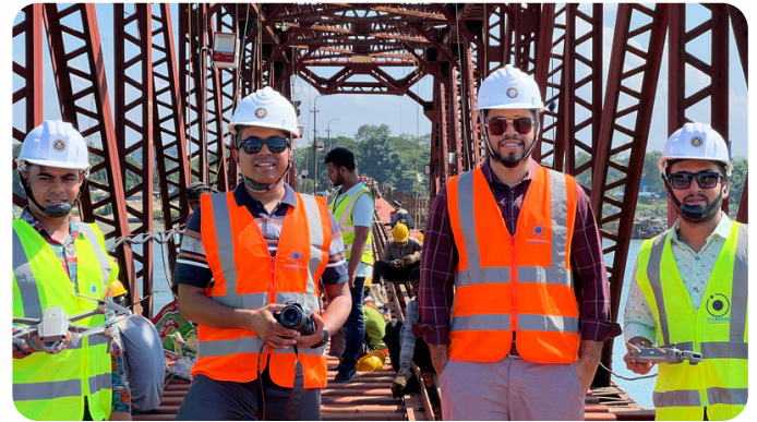
Feasibility Study for the Construction of Railway Cum Road Bridge Across River Karnaphuli at Kalurghat Point in the Vicinity of Existing Railway Bridge in Chittagong District.