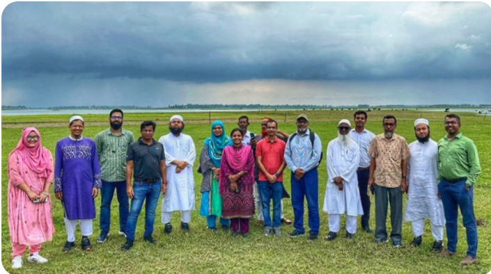
Consultancy services for (A) Detail feasibility study (B) Initial Environmental Examination (IEE), (C) Environmental Impact Assessment (EIA) & (D) Social Impact Assessment (SIA) of Raipura 120MWp (AC) Grid Tied Solar Power Plant Project. Raipura, Narsingdi.

CREEDS is a youth Centre of Excellence in Bangladesh that focuses on open-source modeling and sustainable development research, particularly in the context of the country's significant environmental impact. Its goal is to build a sustainable network of experts from partner institutes to increase the capacity of young professionals in Bangladesh and around the world in open-source modeling, design, engineering, and architecture.